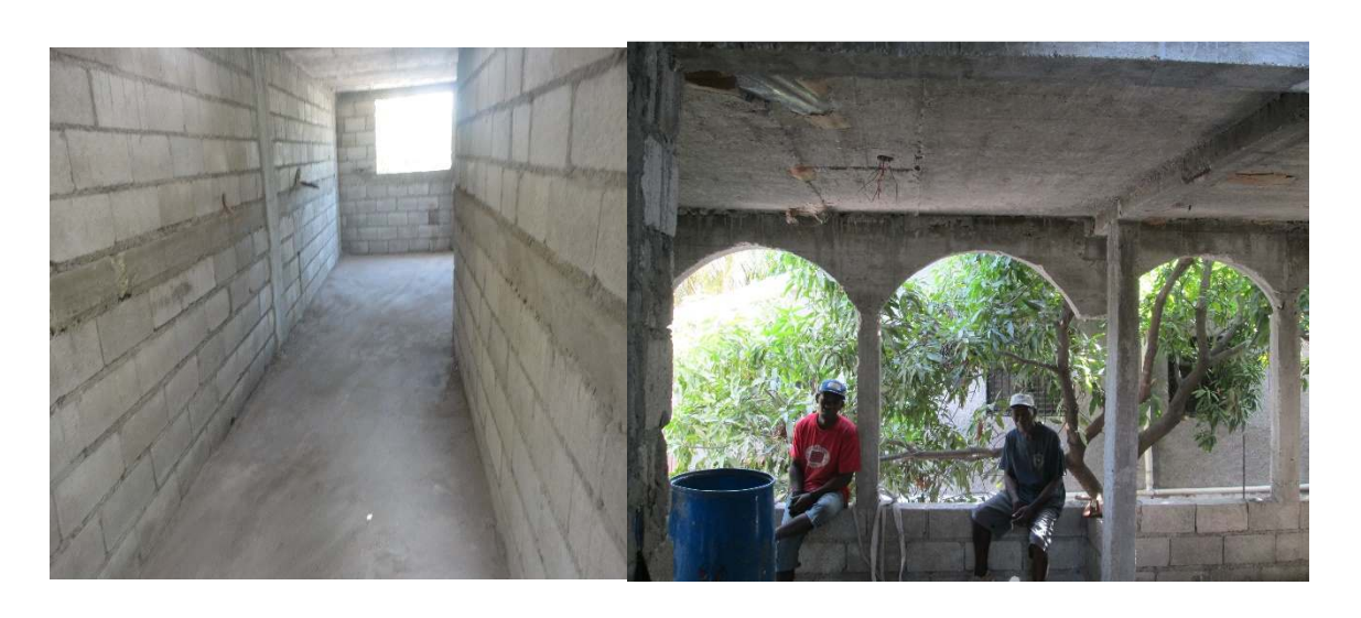
After the Trip